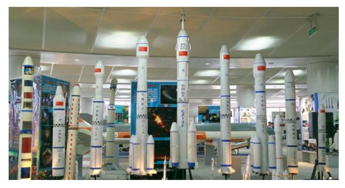
Introduction to the School of Mechatronics Engineering

Mechanical Engineering is one of the oldest disciplines, which was built up at the beginning of HIT in 1920, and is also one of the first established related disciplines in China. After decades of development, the School of Mechatronics Engineering currently comprises 15 departments and research centers. The discipline of Mechanical Engineering ranked No. 2 in 2002 and No. 4 in 2006 respectively at the academic assessment of the Ministry of Education, and was approved as the national key discipline in 2007.